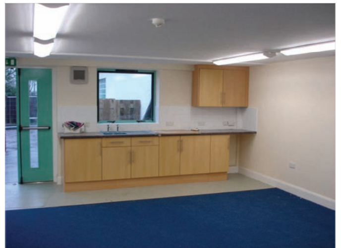
New meeting room